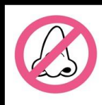
Loss of Smell