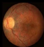
Retinitis Pigmentosa (loss of vision)

Symptom management could include cataract surgery, eye drops, hearing aids, cochlear implants, skin lotions, pain management, knee replacement, heart and liver transplant.