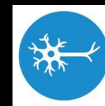
Peripheral Neuropathy (numbness, nerve pain)